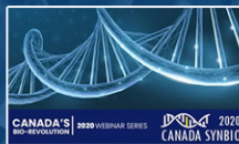
Canada SynBio 2020