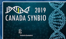
Canada SynBio 2019